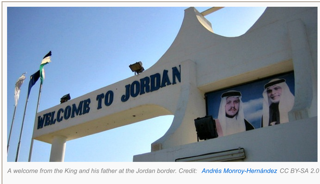
A welcome from the King and his father at the Jordan border.

Unfortunately here, the author fails to link the findings to the socio-political landscape in Jordan and the wider region. The mismatch between expectations and opportunities for young people must be interpreted as a potential source of discontent, and can detrimentally affect social cohesion. In this respect, the lack of subjective indicators in JLMPS 2010 data furthermore forfeits the opportunity to advance our understanding of perceptions, ambitions, and frustrations of Jordanians.