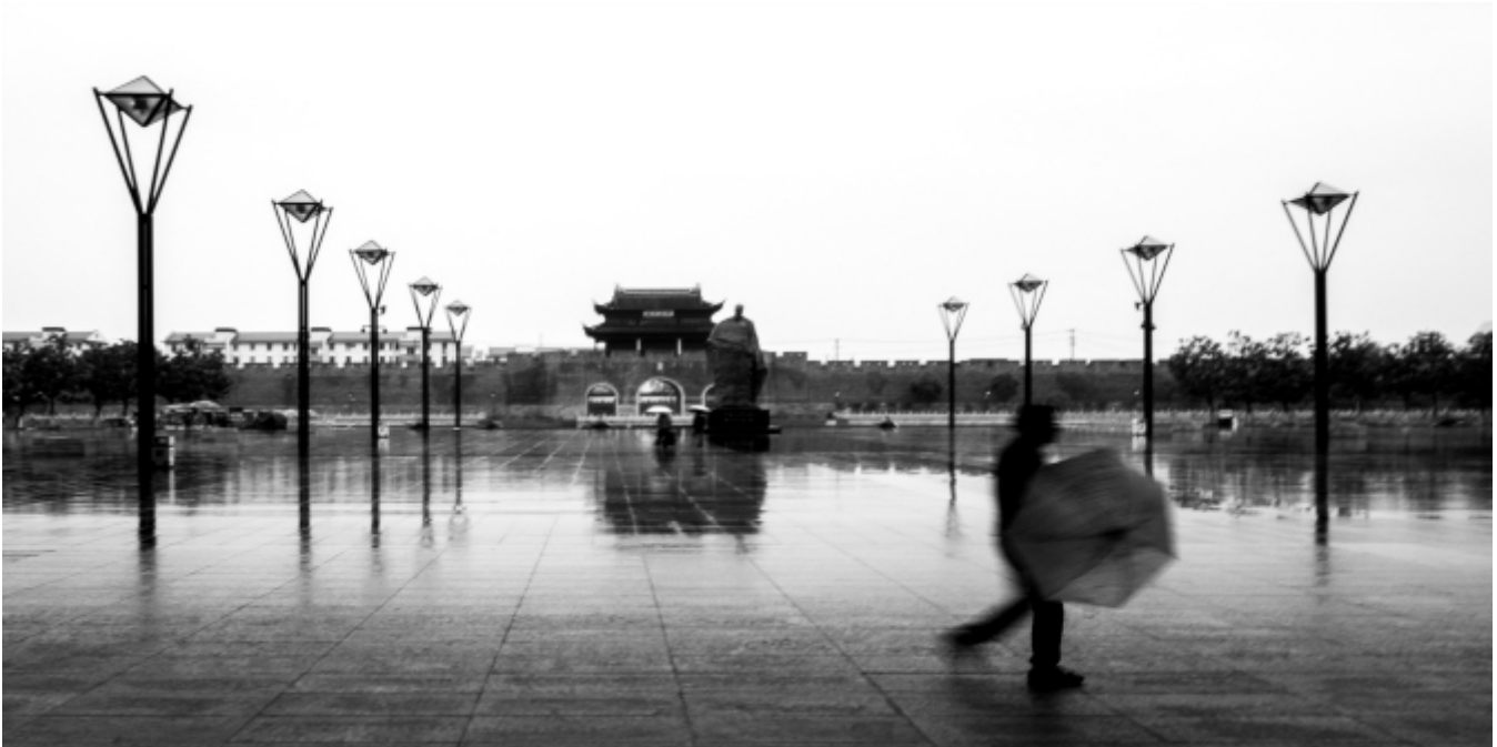
Suzhou main railway station, China