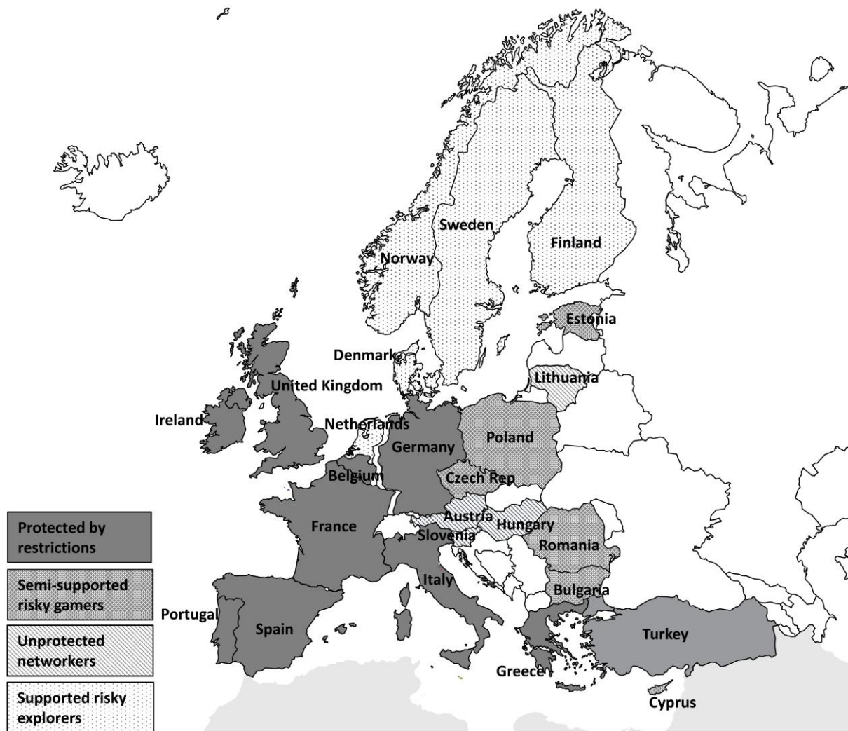
Figure 2: Mapping children's online experiences by country