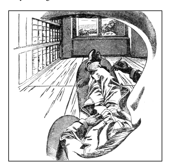
Figure 1. Drawing from Ernst Mach (1886/1914), The Analysis of Sensations.

outside us are integrated with bodily feelings, emotions, conscious thoughts, conscious memories, and imagination. This point of view can be contrasted with a great mass of processing that occurs unconsciously, without surfacing in experience. In humans, this mass includes the early stages of sensory processing, as well as many processes of bodily self-regulation and motor control.