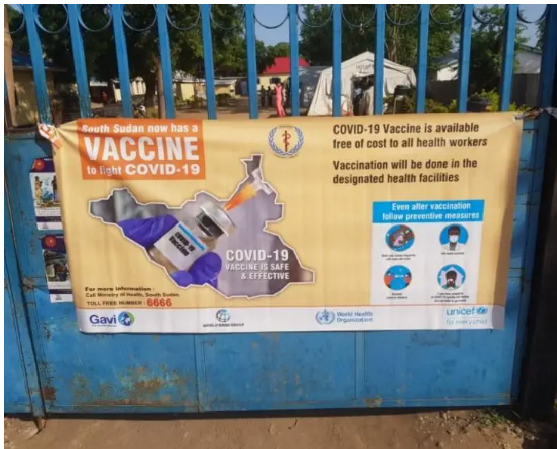
A COVID-19 vaccination poster in Bor, South Sudan, June 2021.

The first AstraZeneca vaccines arrived in South Sudan in the last week of March 2021 . The same week Germany restricted the use of the same vaccines in under 60s at home. The result has been that many South Sudanese feared that Europeans were dumping on Africa dangerous products. Some people in Bor highlighted that the South Sudan government does not have the capacity themselves to regulate the safety of vaccines, providing grounds to mistrust it. Others even feared that these Europeans were conspiring with their own government to harm them through the vaccine; the government had attacked them through military campaigns and was now, apparently, attacking them via medicine.