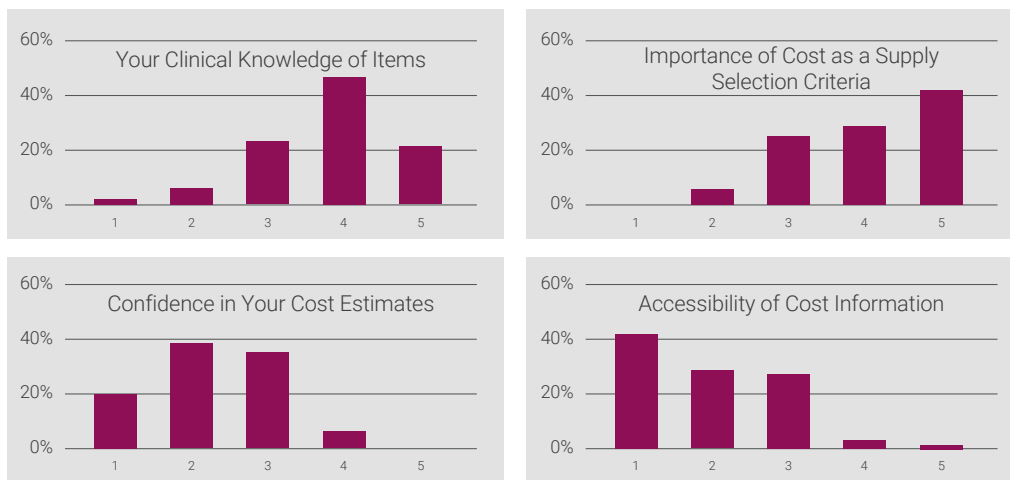
Figure 2: Physician Perceptions of Supply Costs (N=104)

Physicians believed that cost is an important supply selection criterion for clinically equivalent items but indicated a low level of accessibility to cost information at their institutions. Physicians also reported that their clinical knowledge of the medical items presented in the survey was relatively high while their cost knowledge was low, as measured by the confidence in the cost estimates they provided. Cost knowledge was positively and significantly correlated with the experience ( R = 0.27, p < 0.05 ). No other metric was correlated with experience nor gender.