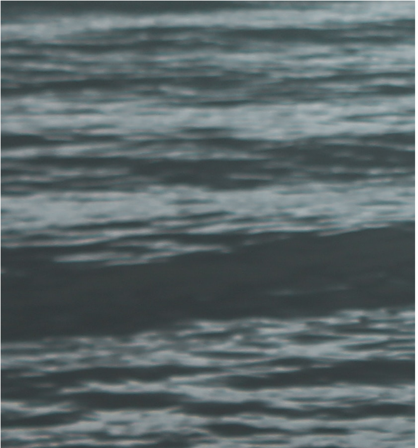
Looking out to sea in Alappuzha, Kerala

The Indian state of Kerala experienced the worst floods and landslides in its recent history in August this year. Torrential monsoon rains left the state facing an average of 37.5 per cent more rainfall than normal, and with energy companies not releasing water from some of the 35 dams in the region before the downpour, water engulfed the state in just a matter of days.