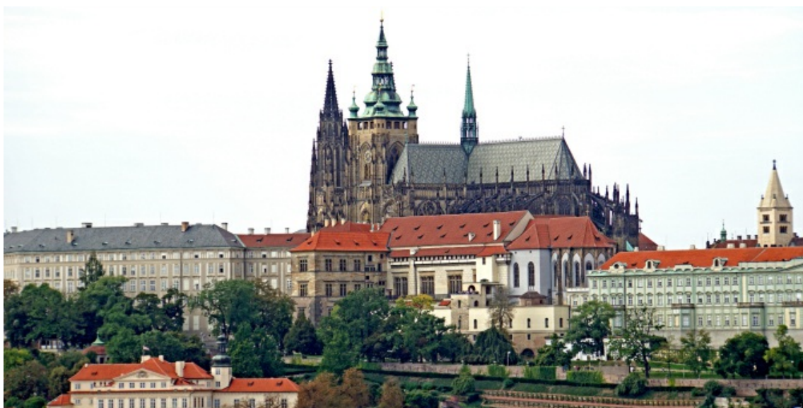
St. Vitus Cathedral, Prague, Czech Republic

The identity of Central Europe was significantly shaped by its Europeanisation in the 1990s, often called 'the transition'. This was a multifarious and multi-layered adaptation of the post-communist and post-Soviet states to Western European practices, regarded as the only appropriate ones for the whole of Europe. In other words, Europeanisation was a deliberate attempt to break away from the East, often perceived as usurper, and join the West, regardless of all the new challenges and flaws this could bring.