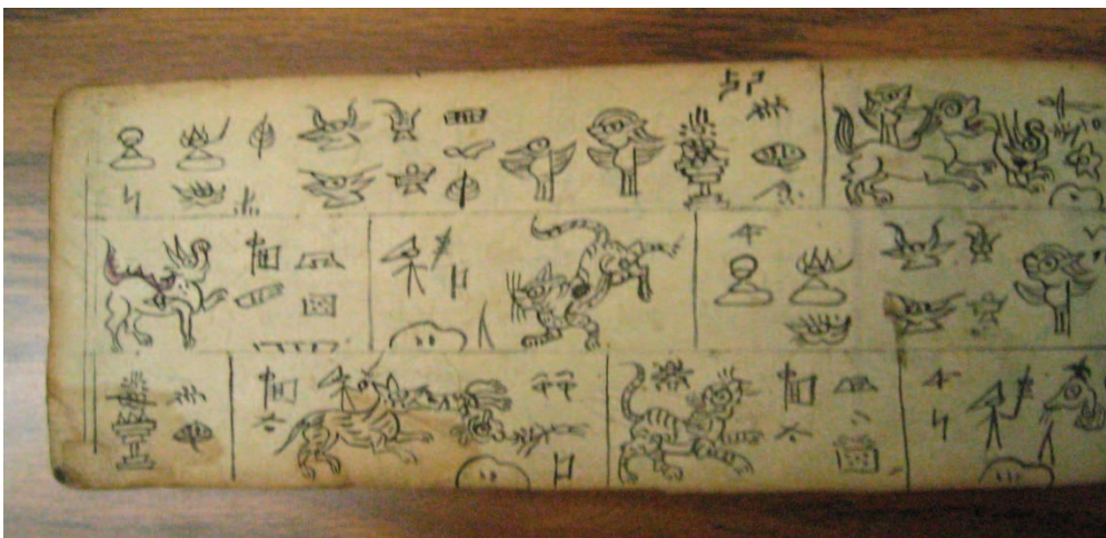
Figure 1. Dongba script on customarily made paper.

The Naxi customarily used the inner bark of Wikstroemia delavayi (in Chinese: lancangyaohua ) to produce paper for documenting so-called "Dongba" sacred scriptures. The term is derived from the eponymous Dongba shaman priests (or Bon priests), who used an ancient system of pictographic glyphs to record religious scripts (Figure 1). Due to its low lignin content (approximately 10%) and thin fibers, the bark of this tree makes high-quality paper, whereas its chemical constituents are said to possess anti-microbial properties [16], not unimportant in a humid and warm environment as Lijiang. Traditional Dongba papermaking was on the verge of extinction as a result of China's developmental policies and the various revolutionary campaigns during the 1950s until the late 1970s.