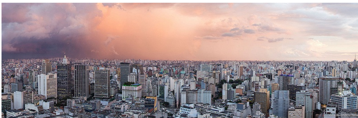
The São Paulo skyline

And then there's São Paulo. If ever an oasis of books were needed, this would be the city for it. Known for being the cultural cousin to Rio, its rich array of art galleries and über-cool bars dot an otherwise overwhelming and homogenous metropolis. The city greets first-time visitors with a heavy-handed dose of traffic and crime-related paranoia, but, thankfully, it is chocked full of unique bookshops to while away the rush-hour and stress.