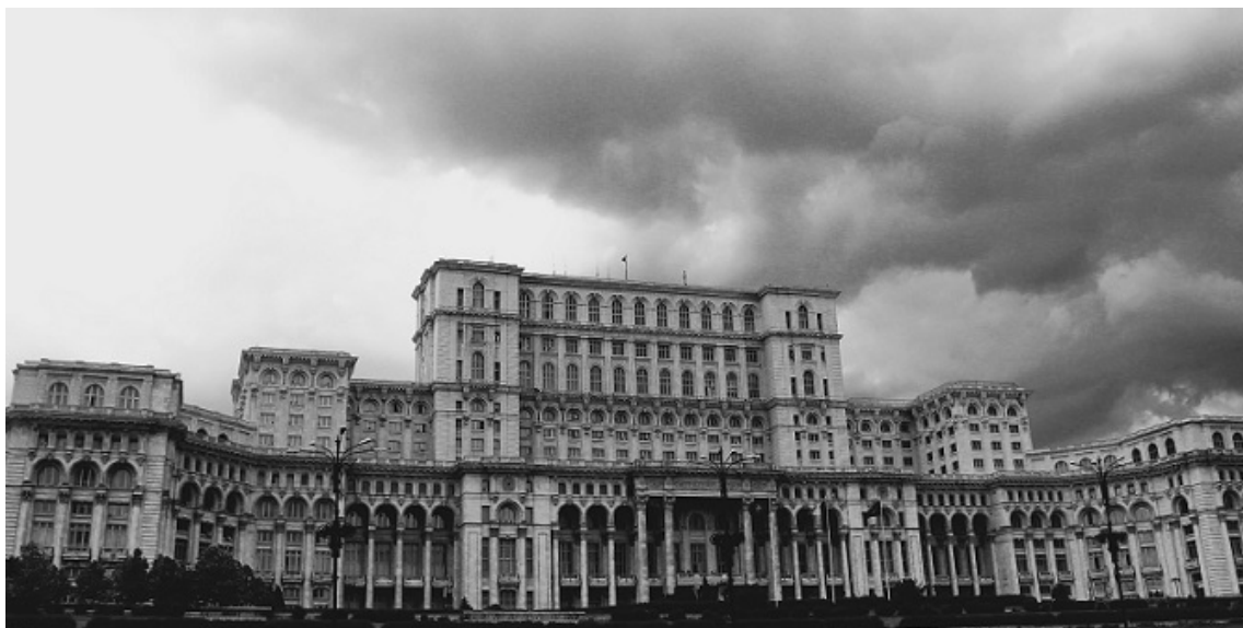
Romanian parliament building

In February last year, the government tried to pass an emergency ordinance that would have decriminalised certain offences and protected politicians already under anti-corruption investigations from prosecution. The result was the largest nationwide protests to have occurred in Romania since the fall of communism in 1989. The emergency decree was withdrawn, but its content has been transformed into amendments entering the parliamentary process. In December last year, significant amendments were approved by the Senate which have been widely criticised by Romanian magistrates, the Venice Commission and the European Commission. Among the most important changes was a reduction in the influence the President has in appointing top prosecutors, including the head of the anti-corruption body.