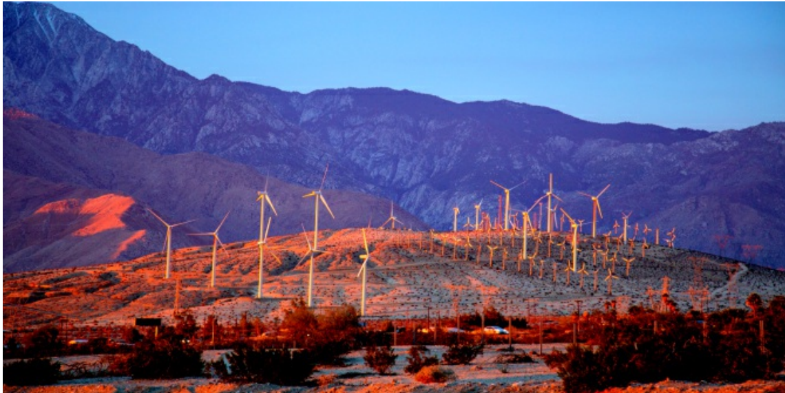
Image Credit: Dillon Wind Power Project, Palm Springs, Riverside County, California ( Tony Webster CC BY 2.0 )

Californian residents have long pushed for environmental regulation to protect their backyards. They live in close proximity to towering mountains, mesmerising waterfalls, ancient sequoias and sun-kissed sandy beaches. California living can be glorious, if natural beauties are preserved. Given this geography, the benefits of environmental protection are highly visible, as are the threats. Residents witnessed coastline erosion, were horrified by blackening oil spills and coughed through the smog. So, this is partly about glaring self-interest.