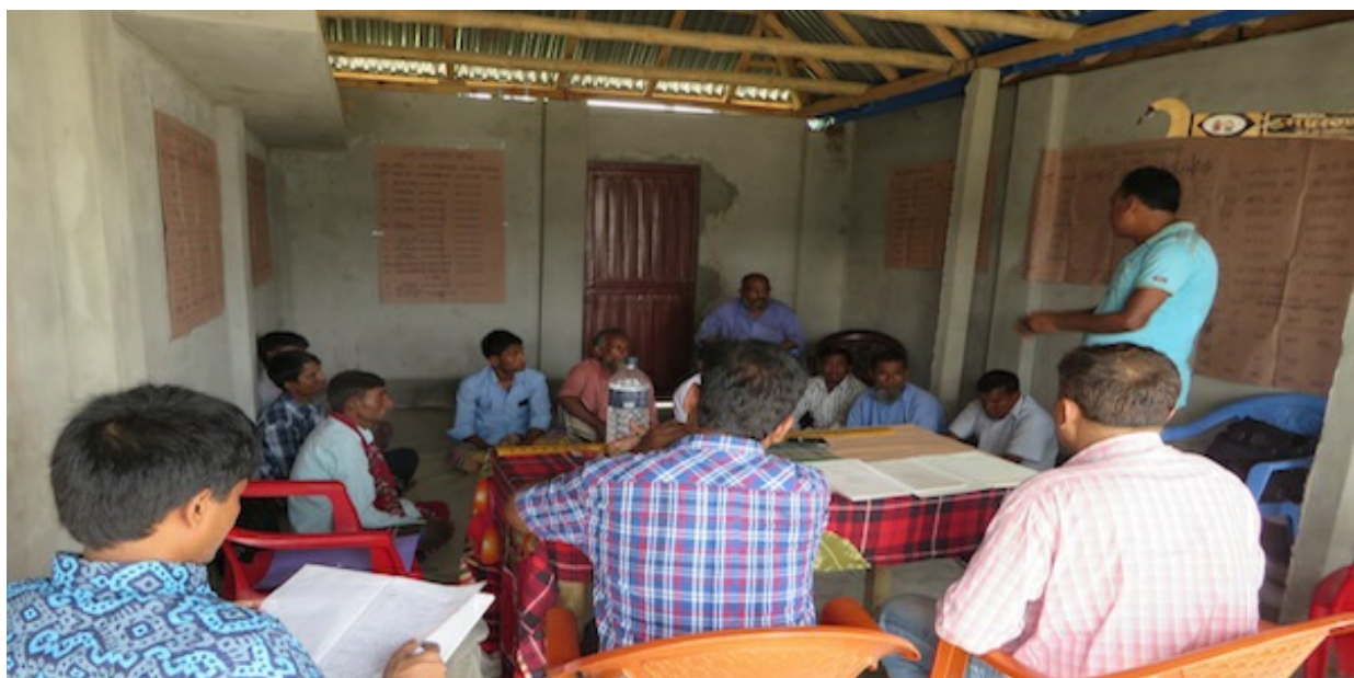
Workshop and meeting in a village.

Based on understandings of different action researches and hands-on consequence of implementation of the decentralisation policy of Bangladesh government , it can be debated that keeping the provision of committees at all levels of governance has become an integral part of law making process since committees these days are well-thought-out as an important mechanism of ensuring transparency and accountability of the UP. Of course, one may surprise, to what extent the system of committee will be able to guarantee transparency and accountability of the activities of the UP when the committees are to be constituted with the spirit of volunteering having no financial and executive authority on the top. Allowing some margins for error, I believe that the exercise of committees in UP will ensure coordination of activities of different departments that would certainly help the process of service delivery to the poorest segment for whom ' access to public service ' is challenging to some extent.