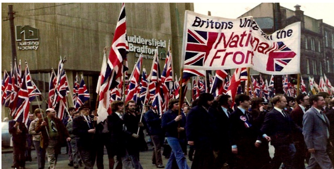
National Front March, Yorkshire, UK, 1970s