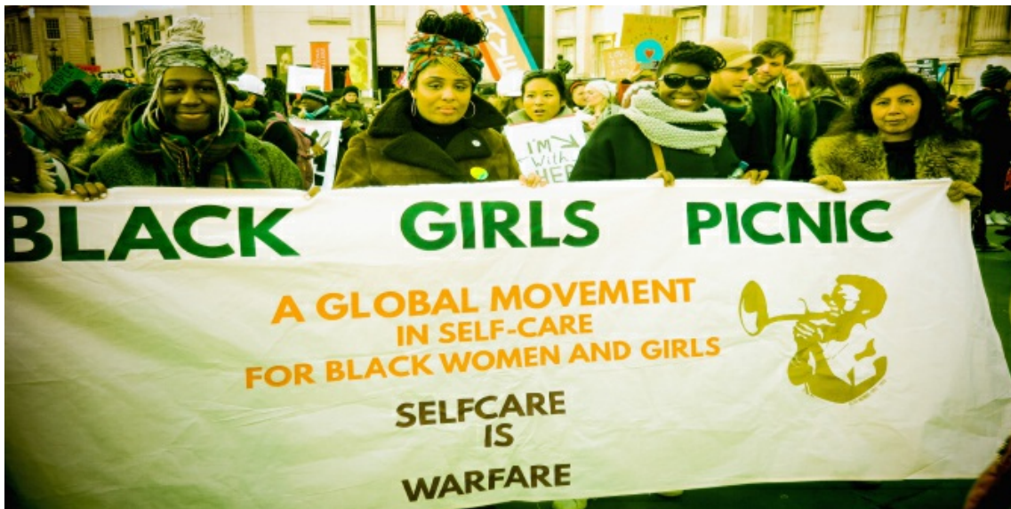
Women's March, London, 2017