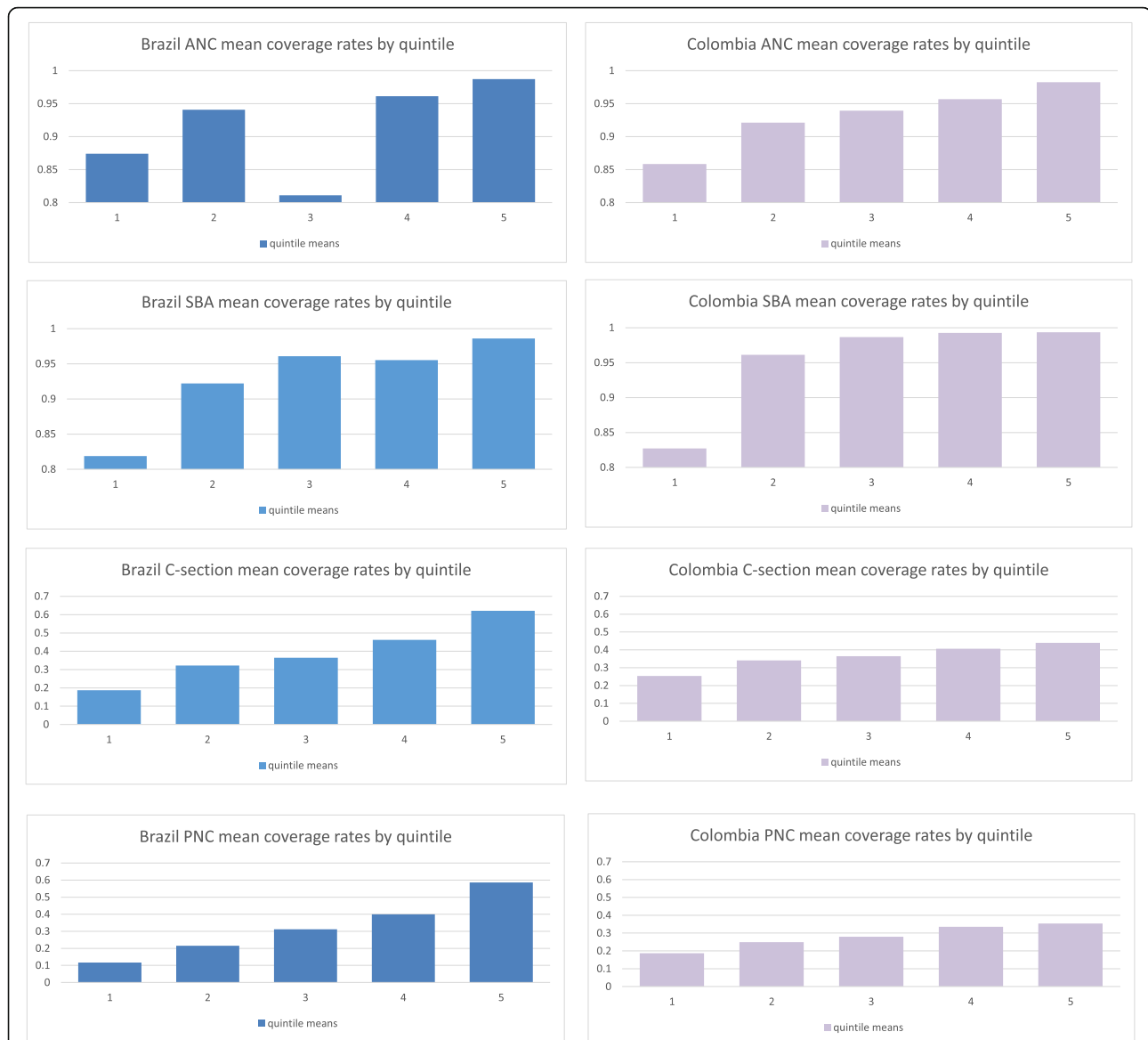
Fig. 1 Intervention mean coverage rates by quintile

Coverage rates in the vertical axes ranges from 0 to 1 however to facilitate visual presentation only part of the scale was shown (from 0 to 0,8 or from 0,8 to 1) to highlight differences in coverage across quintiles. SBA, skilled birth assistance; PNC, postnatal care