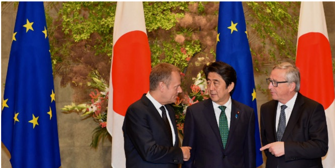
Donald Tusk, Shinzō Abe and Jean-Claude Juncker

In our study , we analysed interviews with 180 elites across four of the EU's strategic partners – China, India, Japan and South Korea. Interviewed elites were asked about their experiences with European organisations, businesses or individuals, about their visions of their country's relations with the EU, and about their images of the EU. We hoped to find differences in the four countries and we did. Explaining those differences lets us begin to understand how perceptions of the EU form and could potentially be shifted.