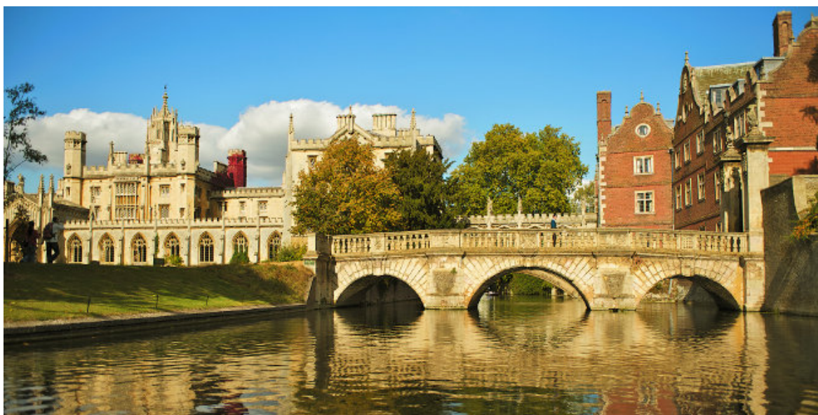
St John's College, Cambridge University

Education levels are often cited as a key factor in explaining differences in opinion between voters, but as Mark Bovens and Anchrit Wille illustrate, many national parliaments have highly unrepresentative numbers of MPs with university degrees. They highlight that the number of MPs with degrees has increased substantially in western European countries over recent decades, and that the absence of low and medium educated citizens in parliaments and other political venues constitutes a serious democratic deficit.