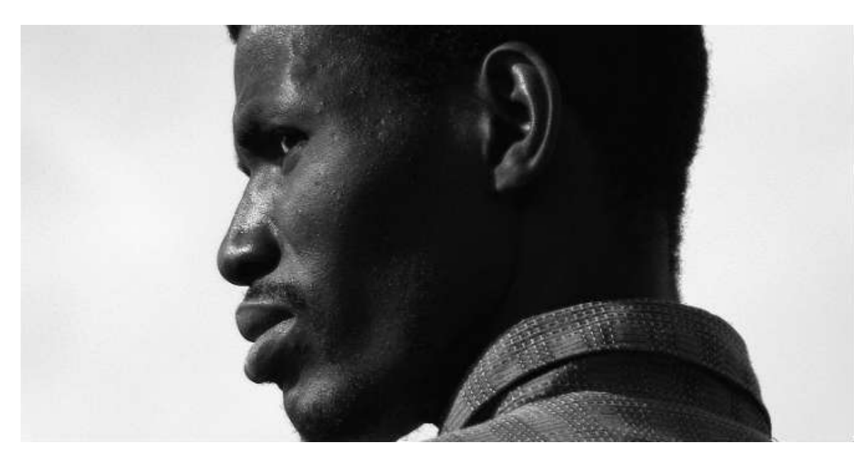
Photo of African migrant in Spain

However, what is more interesting is how the writers describe the island to be alive with "travel" agencies, buses, and smugglers, all operating in broad daylight. All of this only serves to show how complex the smuggling business is as Reitano and Tinti demonstrate in the first part of the book. We learn how the industry operates, the rules and practices that govern this world. How profitable Syrian lives are, how less valuable African lives have become in the eyes of some smugglers where only top dollar counts. We learn about reputation and damaging reviews, even migrants rate like we do on yelp for smuggling services. Thankfully, third-party insurers holding their payments serve as meagre protection in case the operation fails. But more frightening, we learn how sophisticated, how criminal this industry has become with criminal businesses interacting with political and security apparatuses of many countries: