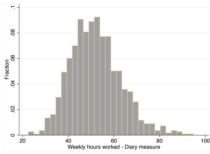
Figure 1: CEO weekly hours worked, diary measure

Notes: The graph shows the histogram of total weekly hours worked (built from actual diary data) by a sample of 1114 CEOs.