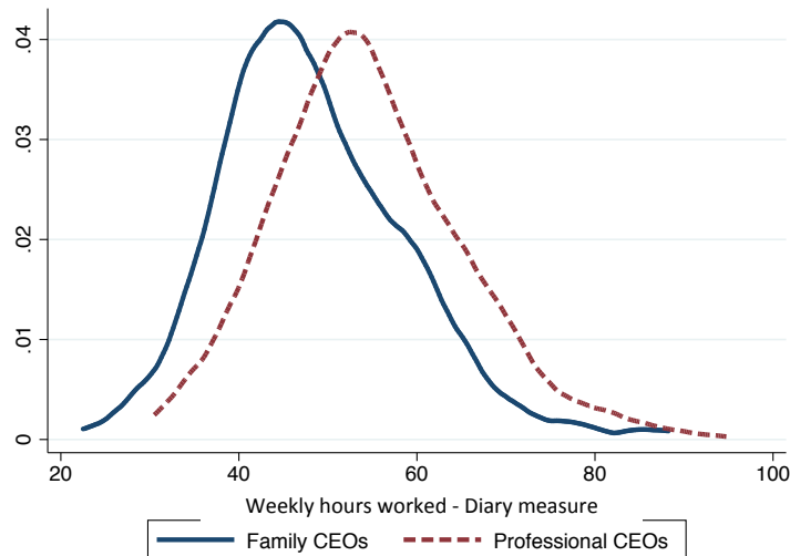
Figure 3: CEO hours worked: differences between family and professional CEOs in the raw data

Notes: The graph shows the kernel distribution of total weekly hours worked (built from actual diary data) by a sample of 1114 CEOs, of which 458 classified as "family CEOs", and 656 classified as "professional CEOs".