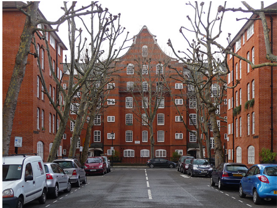
Erasmus Street

presented at the Redesigning Social Housing against Poverty in Europe (RESHAPE) annual conference in Bozen-Bolzano (Italy). Her presentation, Social housing in England after the GFC: affordable vs 'affordable' (download PPT here ), covered themes such as England's 'housing crisis', changing nature of social landlords, and