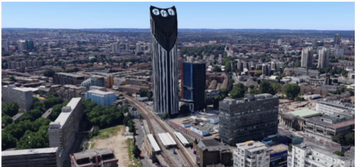
'Diving in' to understand how the developments fit in to the context of the local area

Whilst warnings against 'armchair research' are valid, and being immersed in the field itself remains an integral research method, there are also huge benefits to the virtual city approach. Firstly, the ability to both 'fly' and 'dive' around the city. 'Flying' enabled us to examine the city from a birds-eye perspective, helping us to grasp not only the size and scale of individual developments, but also enabling us to assess the ways in which they fit (or don't) into the wider context of the local area. For example, how do high-density developments in the relatively low-density borough of Ealing compare in terms of design, layout and size to developments in Elephant and Castle, a comparatively dense part of the city?