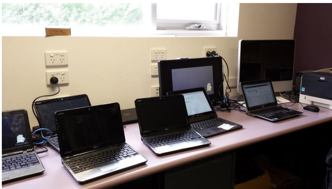
Figure Eight. Backlog of student devices waiting to be fixed by JB Hi-Fi technicians (Lakeside)

A lot of students come in to ask for my help and I’m not obliged to help them. I still do because that’s the right thing to do, you can’t really deny a student for helping small issues to get them back on track ... but I had a flood of students come in to me with their phones and say “Hey look my phone’s not working”. And I say, “Well look sorry guys, I don’t fix Telstra [Australian telephone network] stuff, you know, I fix the devices of the school ... With [school-owned equipment] it’s simple I can pull apart a computer completely, do whatever I want to it, and it’s fine. But a student’s one, we wouldn’t ever dare open it up because if something was misplaced or not put back in the right way then we can be held accountable for any damage. [38]