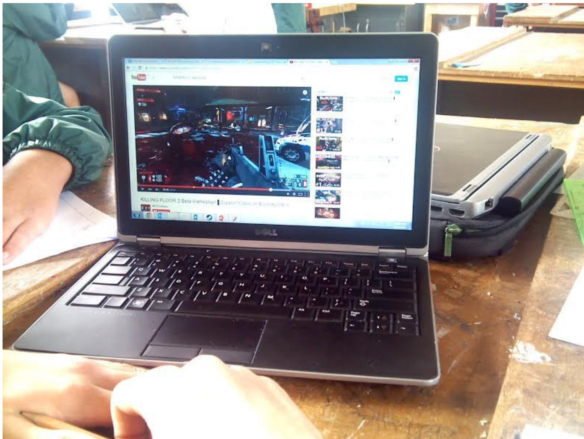
Figure three. Year 9 – Killing Floor2 video on YouTube (Lakeside)

responding to text messages and very occasionally taking calls. These communications almost always were initiated by parents and carers. Policing this practice was acknowledged as an on-going and largely unresolved problem for school authorities. As a Middleborough Assistant Principal described, “the parents think they can call their kids at any time, even during class. They don’t bother going through us. They call the student directly. Sometimes students call their parents and tell them they’re sick and want to go home. We’ve had the occasional student go home without telling anybody” [23]. All three schools were reluctant to impose outright bans, but felt obliged to ‘discourage’ parents and students from contact [24]. School newsletters and websites would carry reminders and warnings after notably disruptive incidents (see Figure Four). All told, an underlying concern for school leaders and administrators was that student devices were allowing families to ‘bypass’ official systems - “they’ve got to go through the correct channels” [24].