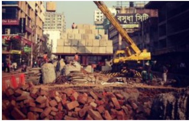
Dhaka under construction