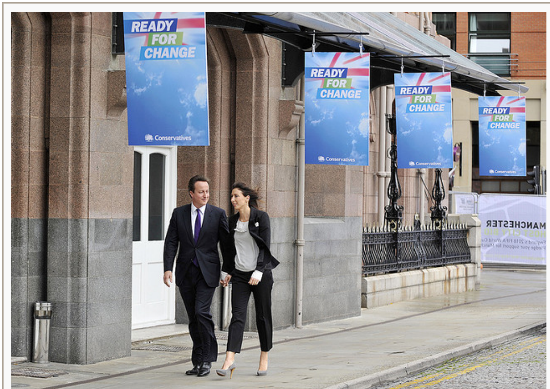
Could the Conservative Party be reduced to a single member by 2020?

February is the shortest month of the year, but that doesn't mean that we haven't learned an awful lot about democracy. In just 28 short days, we've found out about online voting, the public's dismal view of Prime Minister's Questions, perceptions of corruption, and an unlikely revival for a Jeffrey Archer storyline.