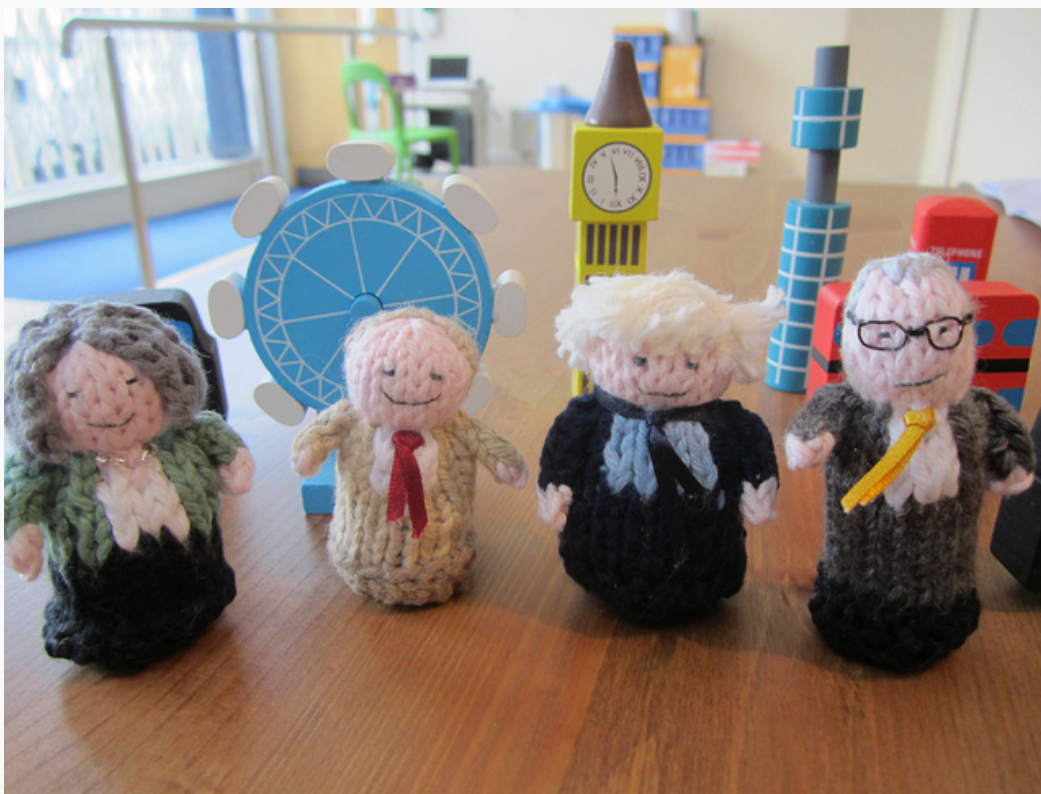
The London Mayoral election saw many voters support an unfavoured candidate due to a paucity of options elsewhere.

It is well established that voters are more likely to think highly of their political systems when they produce the outcomes that they wish to see, but what of those voters who, for a number of reasons, do not vote for their favoured party? Shane Singh shows that these voters are less likely to share in this satisfaction, owing to a number of factors including the policies and political outcomes that may result from the victory of a less favoured party.