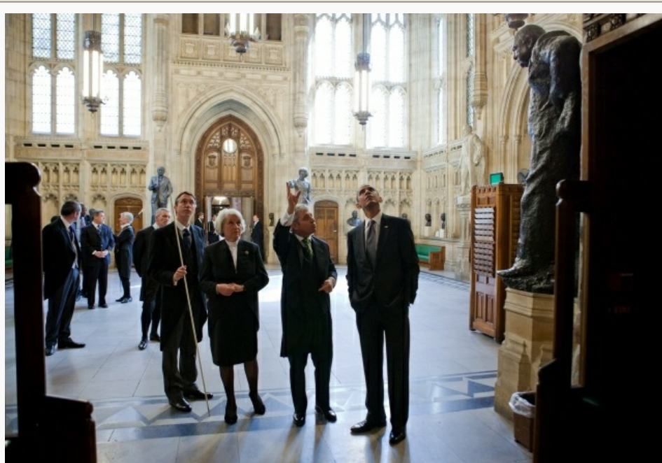
Both the Prime Minister, and President Obama were thwarted by Parliament. But how often does it get in the Government's way?

David Cameron's defeat last night in the Commons on his motion on military intervention in Syria has been met with shock, and correctly seen as a very visible assertion of parliamentary power. Dr Meg Russell of the Constitution Unit at UCL argues that although such confrontations are unusual, it would be wrong to assume that parliamentary checks on government ambitions are the exception. In fact, they happen all the time.