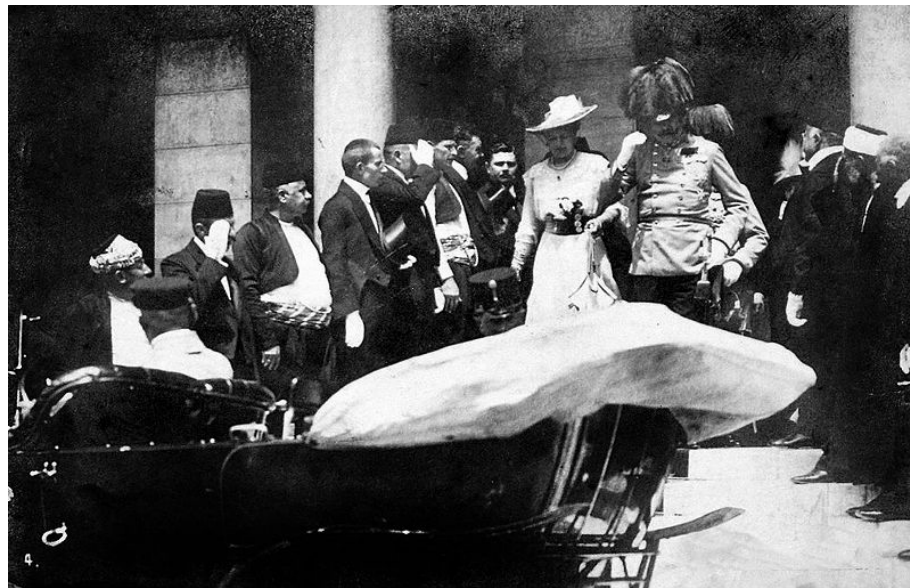
Postcard for the assassination of Archduke Franz Ferdinand in Sarajevo.