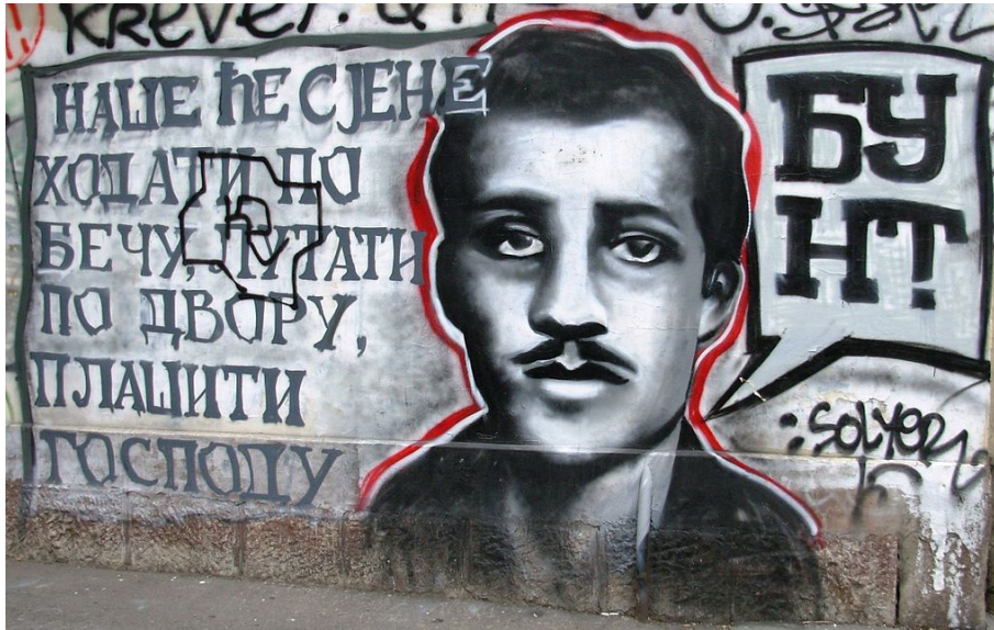
"Our shades shall roam Vienna, haunt the court, frighten the lords", says this graffiti in Belgrade, depicting Gavrilo Princip.

Princip was born in 1894, in a village in western Bosnia, as the sixth of nine children, and one of only three to survive infancy. When his family sent him to continue secondary education in Sarajevo he would meet and soon join members of the nationalist youth.