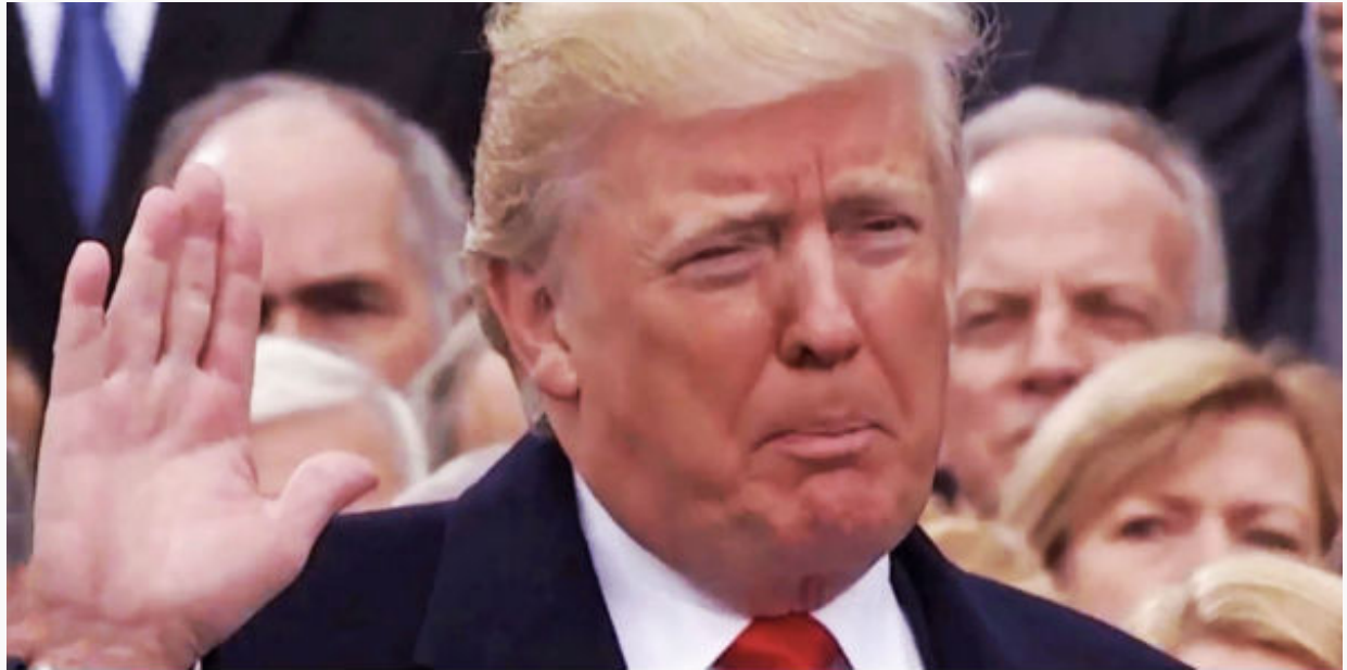
Donald Trump is inaugurated on 20 January.