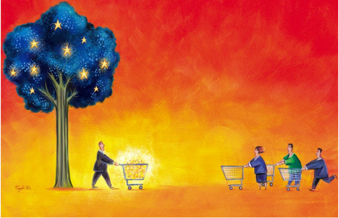
Choose Your Future by Trayko Popov