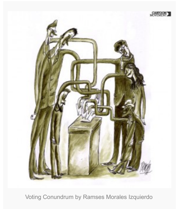
Voting Conundrum by Ramses Morales Izquierdo

In the run up to the European elections, we have been asking cartoonists to challenge prevailing notions of democracy and representation, to reflect on alternatives, and to offer fresh perspectives on more inclusive societies across Europe and beyond. In short, we ask: what is the future of Europe? Will it be a fortress designed to keep other people out, or no more than a free trade zone? Will Europe evolve into something more, a political entity with a true European citizenry?