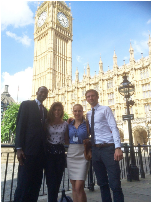
Four MSc International Development and Humanitarian Emergencies students at Westminster following their presentation.