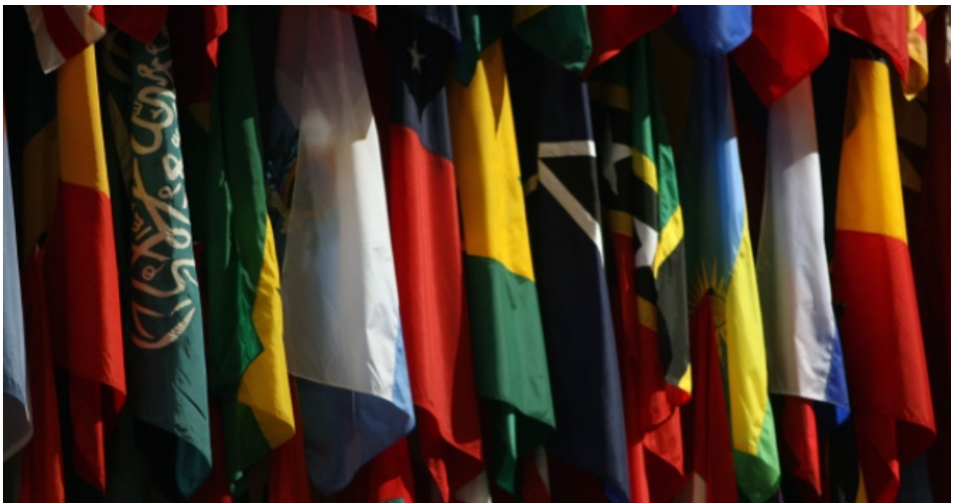
World Bank/IMF Annual Meetings 2009. Opening plenary session. Istanbul, Turkey. October 6, 2009

This system has witnessed significant changes in power relationships and policy agendas since metropolitan powers began aid programmes in the 1920s and 1930s to strengthen their economic relationships with their colonies. (Brett, 1973) The modern aid system was created in the 1940s by the USA, the IMF and World Bank to deal with post-war and then post-colonial reconstruction; transformed yet again in the 1980s and 1990s through Structural Adjustment Programmes (SAPs) that globalised the neo-liberal response to the economic crisis, (Brett, 1983; 1985) and most recently with the use of Austerity Programmes in the European Union to deal with 2007/8 crisis. Their role has been transformed again by a series of high-level agreements in the 21 st century, negotiated that produced the Millennium Development Goals (MDGs) in 2000, the Paris Declaration on Aid Effectiveness in 2005, and the Sustainable Development Goals in Addis Ababa, and Paris Climate Change Agreement in 2015. ^