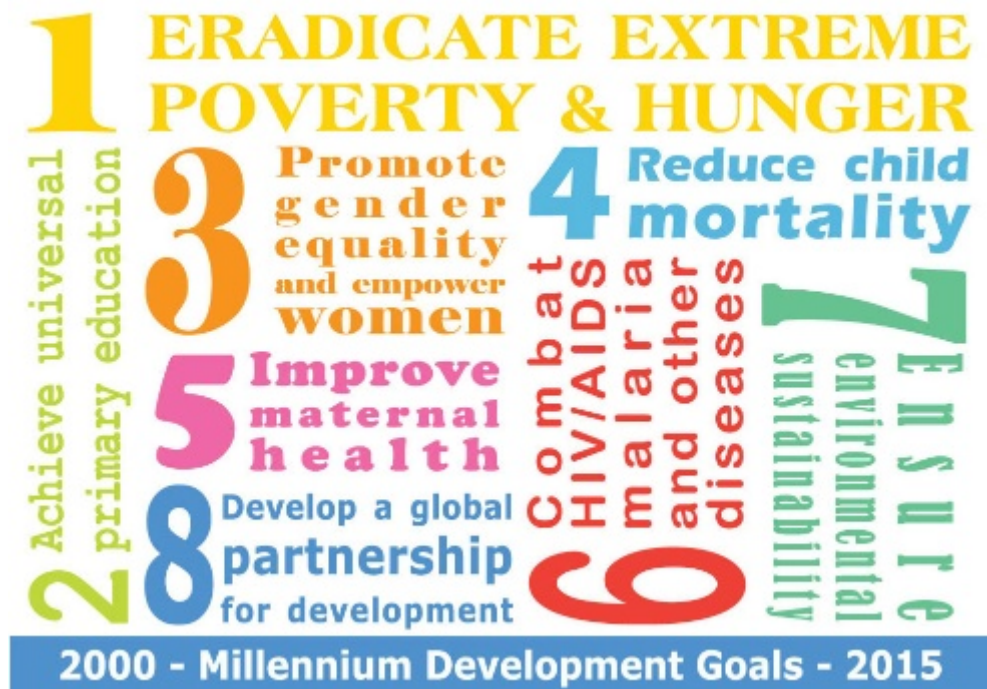
Millennium Development Goals Postcards

These agreements are a response to the political and economic conflicts generated by SAPs in the 1990s and by the recessions, wars, terrorism, humanitarian emergencies, mass migrations and intensifying environmental degradation that have dominated the 21 st century. They do include a strong commitment to poverty focussed policies, a shift from the fundamentalist neo-liberalism of the 1980s and 1990s, and an attempt to increase the bargaining power of recipient countries in aid negotiations. We cannot over-estimate their importance since these multiple crises clearly threaten us with a return to the ‘chaotic competition, monetary disorders, depressions, political disruptions and ... new wars within as well as between nations’, (White, [1] 1944/1969: 37) that followed the First World War (Keynes, 1920/2005) and was only avoided by the massive redistributive transfers that occurred after the Second.