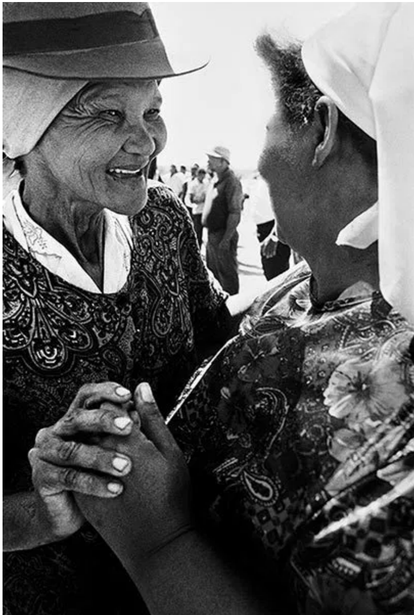
Sisters reconnect after 20 years of separation as a result of the apartheid removals, Riemvasmaak, Northern Cape. 1995