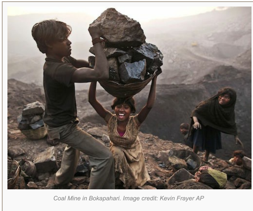
Coal Mine in Bokapahari.

Nonetheless, India's continued commitment to the use of coal represents a serious cause for concern. The country's Power Minister has promised to double the country's domestic consumption of coal to in excess of a billion tons by 2019. This would have a huge impact on global emission levels whilst also destroying vast tracts of the environment where the mines are located. Then there is the devastating human cost, of the barbaric and exploitative working conditions of the mines themselves, the livelihoods destroyed as civilians are shifted from their homes to accommodate aggressive and expansive mining projects, the towns and cities rendered unliveable due to extreme levels of pollution, as well as the longer-term threat to India's people.