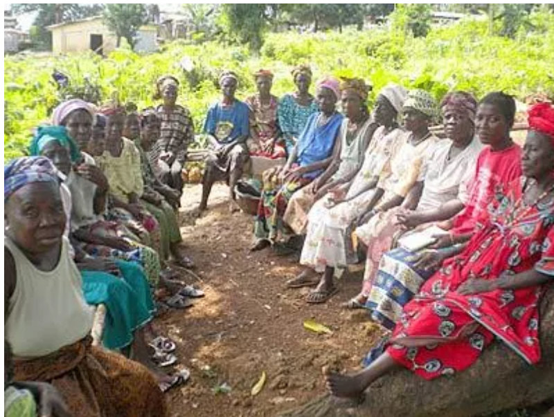
Members of the Women's District Farming Association in Sierra Leone

In 2011, the American Journal of Public Health estimated that 48 women are raped every hour in the Democratic Republic of Congo (DRC). Some experts have even suggested that the figure is much higher considering the number of unreported cases. Sadly, rape as a weapon of war is not exceptional in the Congo; rather it is pervasive in many fragile states. According to the Journal of Peace Research, roughly 75 per cent of all Liberian women were raped during the civil war. In the case of Bosnia, experts believe that between 20,000 to 50,000 were affected. In view of these shockingly high numbers, women are often portrayed as helpless and despairing victims. Strikingly, this often overlooks an important point.