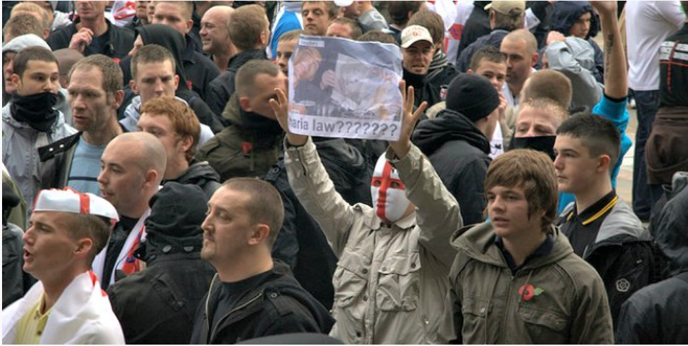
UAF/EDL march in Leeds October 31 2009.

Kundnani delineates the divergent histories of the UK and US's respective Muslim populations in the context of very different, albeit occasionally intertwined, histories of (neo)imperialism, migration, and racial politics. He goes on to suggest, however, that 2005 represented a watershed year in which the 7/7 bombings in London brought the UK into close alignment with the US. As a result, the substantive historical, socio-political and demographic differences fell away and the UK and the US were united, not only in their ideologically inspired military encroachments, but also in their preventive counter terrorism measures against 'home grown' terrorism.