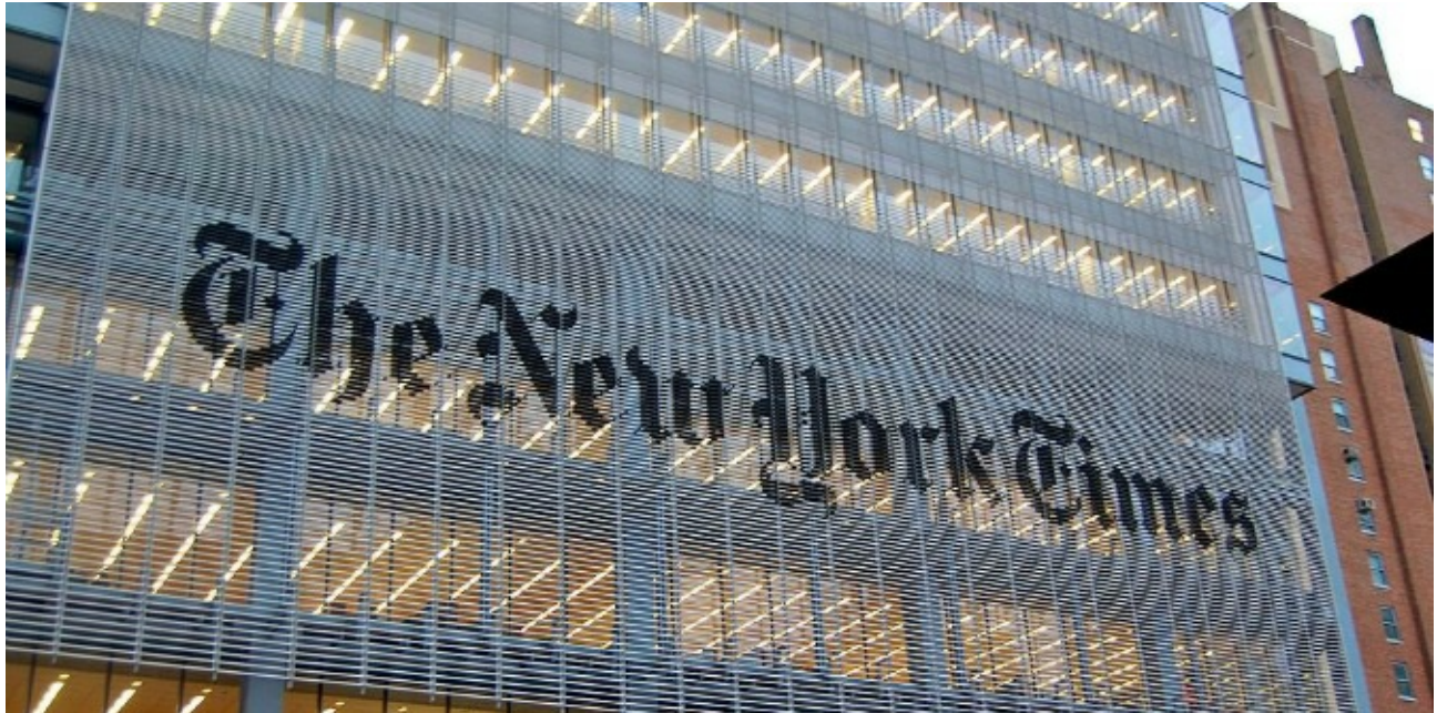
The New York Times building , by Haxorjoe, under a CC-BY-SA-3.0 licence

Firms that are more visible in the press are better governed and more profitable. But investors underestimate the value of visibility and could profit from investing into high-visibility firms.