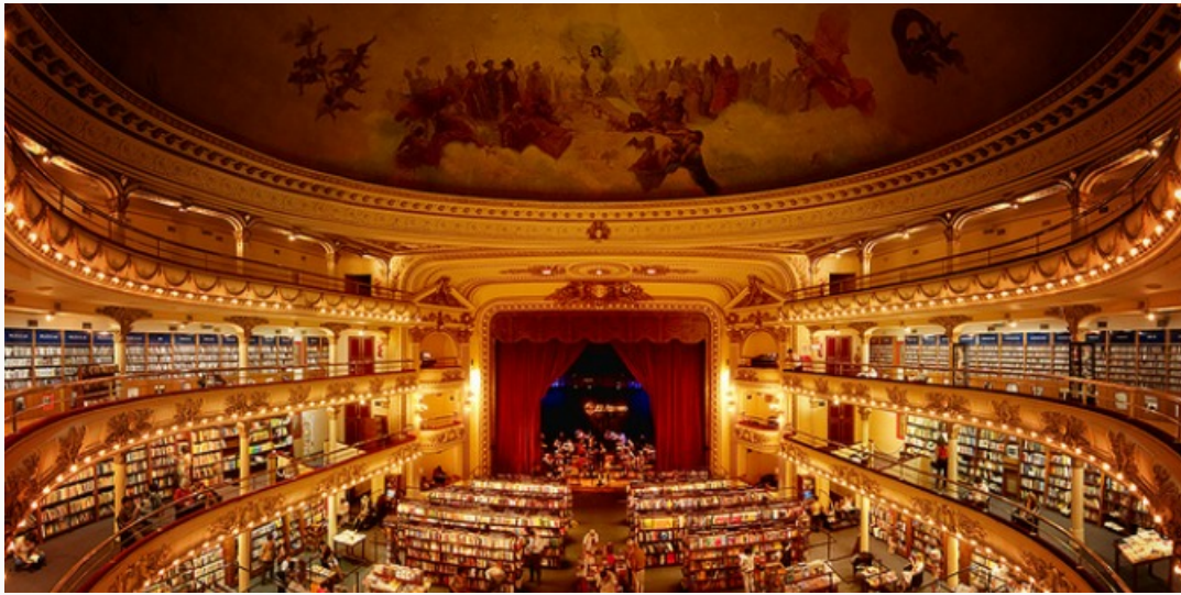
El Ateneo.

Despite extensive restorations, most of the original structures- the stage, theatre boxes, central dome, and ornamented walls – were kept intact. The restored dome still features beautiful frescos by Italian artist Nazareno Orlandi. The private boxes have been transformed into small reading rooms, where visitors can sit and browse their selected titles. The stage, with its heavy, dark red curtain, now works as a café, offering live music in the evenings.