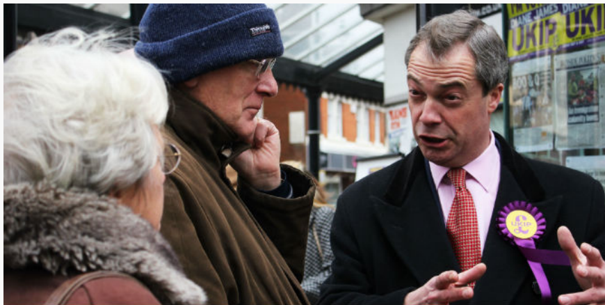
Nigel Farage campaigns in Eastleigh in 2013.

Such areas contrast sharply with strongholds of support for Remain, such as including Lambeth, Hackney, Haringey, Camden and Cambridge. Of the 50 authorities where the Remain vote was strongest, 39 were in London or Scotland.