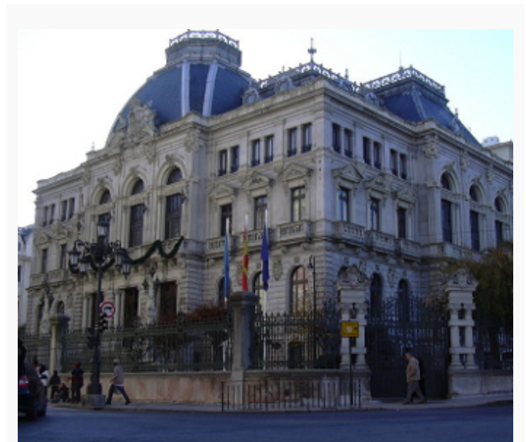
Parliament of Asturias in Oviedo

From the National Accounts data series, we also find a surprising consistency in the territorial distribution of social spending, despite huge budgetary adjustments. Throughout the whole period of the crisis, more than 90 per cent of spending on education and health was at the regional level; while 90 per cent of the total spending on social protection and pensions was concentrated mostly at the central level.