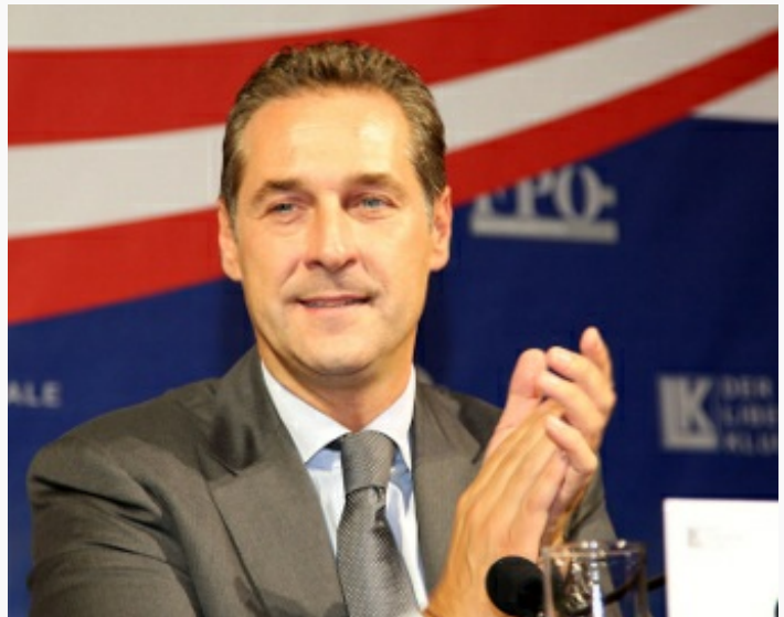
HC Strache, Chairman of the FPÖ

The future of the army was the subject of a popular vote in 2013, when a proposal to end the practice of conscription was rejected in a non-binding referendum. Recently, the Social Democratic Minister of Defence pushed forward a reform programme that reduces the army’s budget and capacities, while trying to legitimise this course of action with