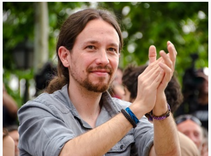
Podemos' leader Pablo Iglesias.

Beyond the active participation of academics in parties, there has also been a broadening of Spanish commentary, with an influx of new online publications and new forums for discussion that have their roots in academia. But how new is this process for Spain and does it constitute a genuinely novel trend for Spanish politics?