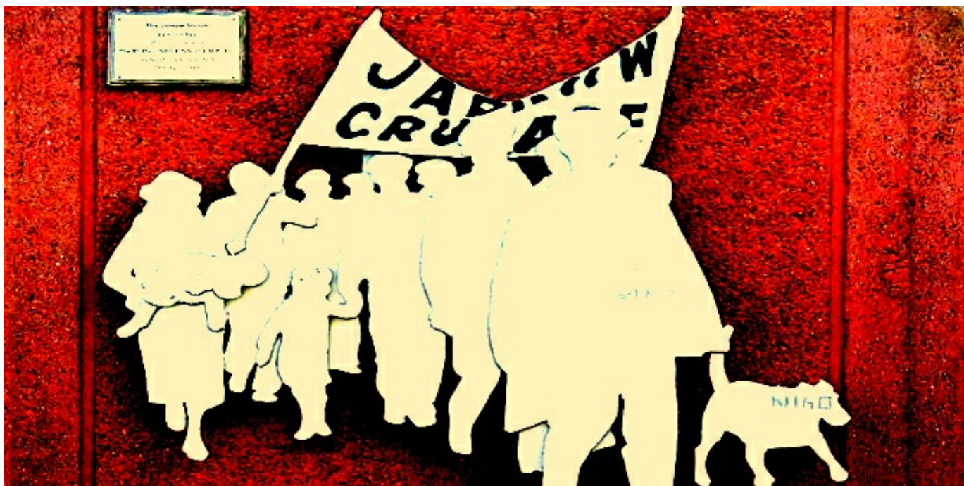
'The Jarrow March', Jarrow Metro Station

outbreak of the Spanish Civil War, in particular, did not see the left coming together to overthrow fascism as she had anticipated, despite men and women from across Europe travelling to Spain to fight in the resistance. Europe did not unite, and was subsequently plunged into darkness.