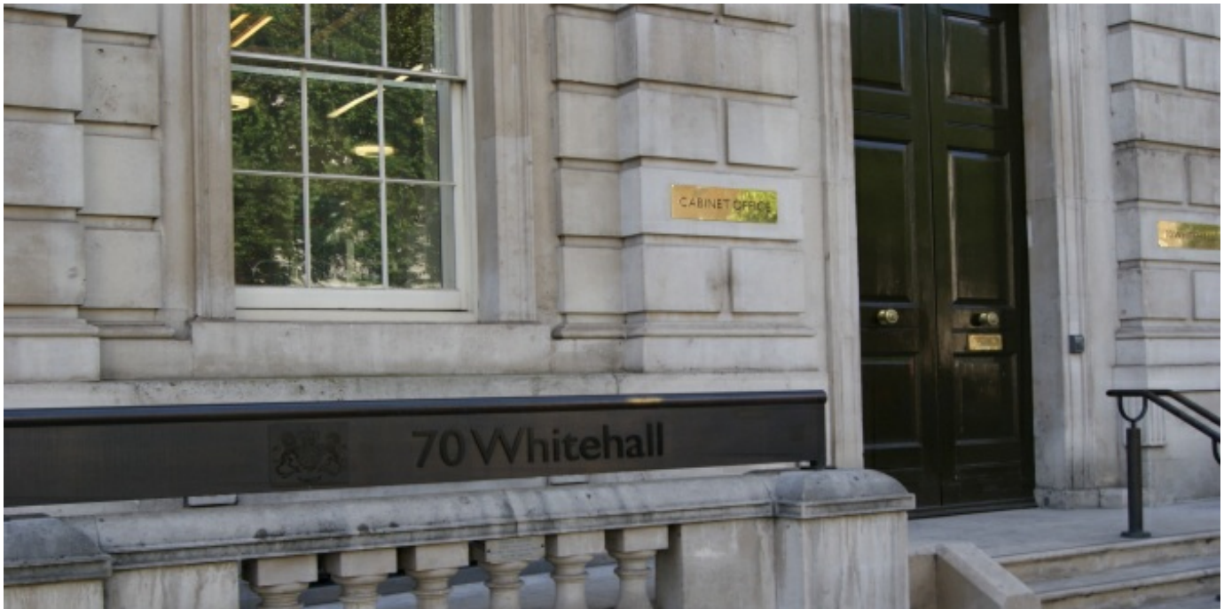
The entrance to the Cabinet Office, 70 Whitehall, London, UK

relationship between Maurice Hankey's strategic far-sightedness, militaristic expertise and management of the Whitehall machine when advising Lloyd George (35) and, for example, the New Labour mastermind's contempt for the Cabinet Office and collective decision-making by Cabinet government (274). Yet Seldon weaves through those complex, awkward relationships between Cabinet Secretaries and Prime Ministers and ministers as they face gruelling problems, leading to a fuller evaluation of the fundamental conflict implicit in the modern role of the Cabinet Secretary in that it is, at one and the same time, both a servant of the Cabinet and an adviser to the Prime Minister.