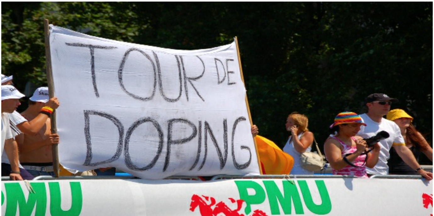
Protest banner against doping at Tour de France 2006

In Chapter Three, Pielke contributes to conceptual clarification of cheating in sport. There has been much talk of unethical practices in sports from match-fixing, underhand action by athletes (e.g. tactical medical time-outs in tennis, the strategic losses of matches and alterations to the pitch) to favouring one of the competing sides through the competition format and management – but are all these instances of the same ‘order’ and damage to the integrity of sport? No, argues Pielke: there is a variety of unethical behaviour. Depending on two key dimensions – violation of game rules and violation of (unwritten) norms – three sorts of dishonest behaviours are derived. These are (1) cynical play, when both values and rules are violated by an athlete/team (e.g. fouling another player while simulating an injury to oneself); (2) gamesmanship, when norms are violated, but rules are not (e.g. unforced medical time-outs); and (3) penalty, when norms are not breached but rules are, for which a consequence to the breaching side is envisaged as part of the game (e.g. awarding a foul or free throws to the aggrieved team). (The fourth is a non-cheating behaviour – ‘ordinary play’ – which breaks neither the game rules nor norms).