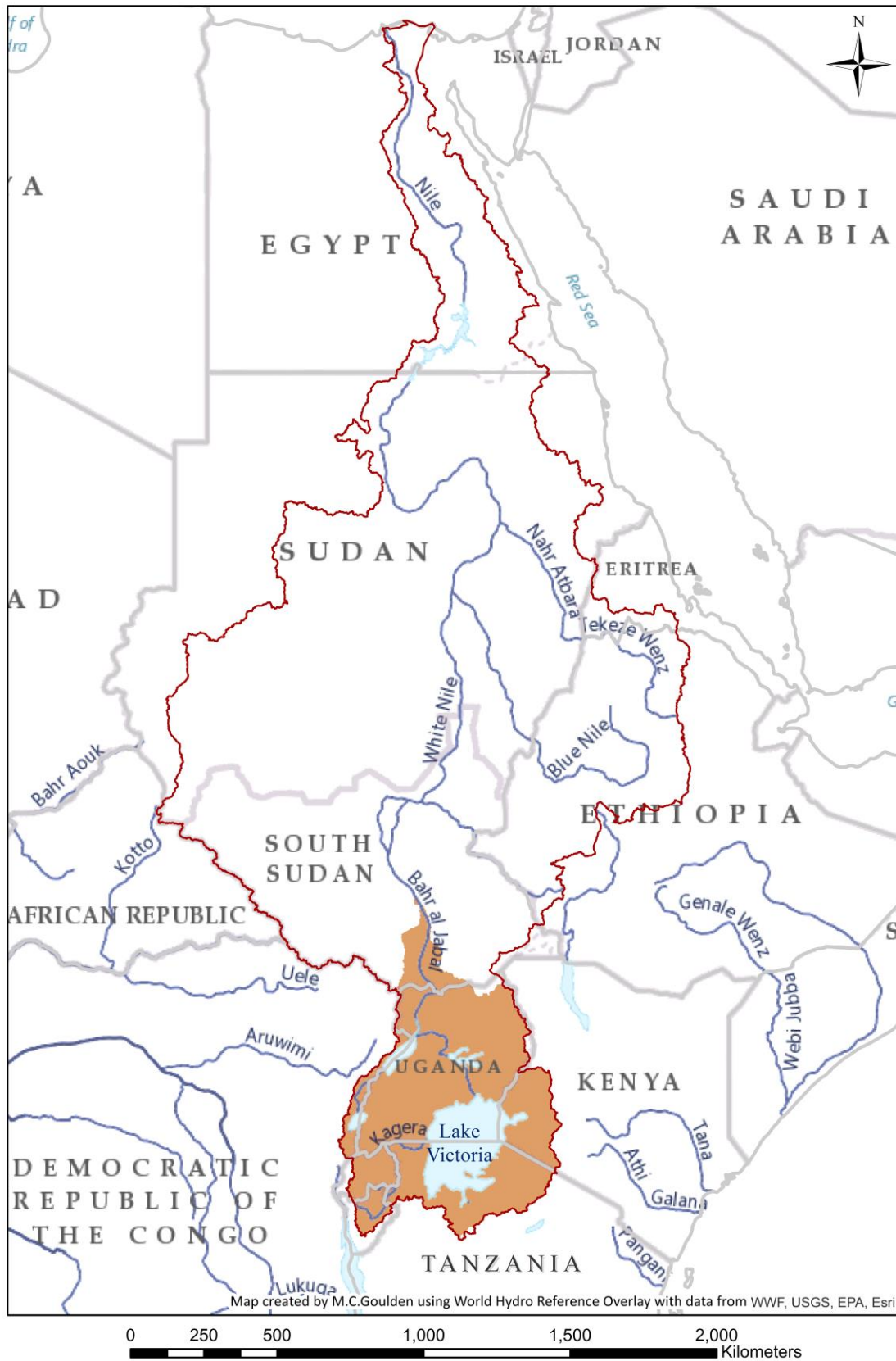
Figure 1: Map of the Nile Basin (boundary shown in red) showing the location of the Equatorial Nile Basin (shown in orange).