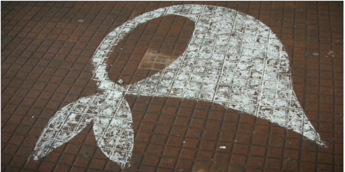
Las Madres de la Plaza de Mayo

military dictatorship. In fact, Minh-ha argues that in their compassionate search for their missing children, Las Madres changed the course of Argentina's history, setting an important precedent for other protestors to rise up against the government, which fell in 1983.