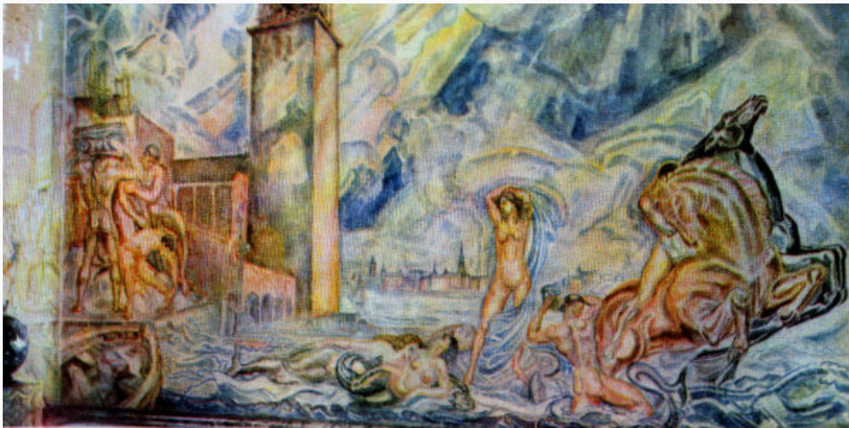
Detail of an expressionist mural by Axel Törneman depicting the building of Stockholm City Hall, 1925.

Some Swedish local authorities have embraced online services and forms of digital democracy. Others have been slow to take up the opportunity. Gustav Lidén rates the country's 290 municipalities according to the depth of their digital engagement, and looks at the possible factors influencing it. Lack of enthusiasm from senior politicians and bureaucratic inertia are key reasons why local councils are reluctant to invest in digital politics.