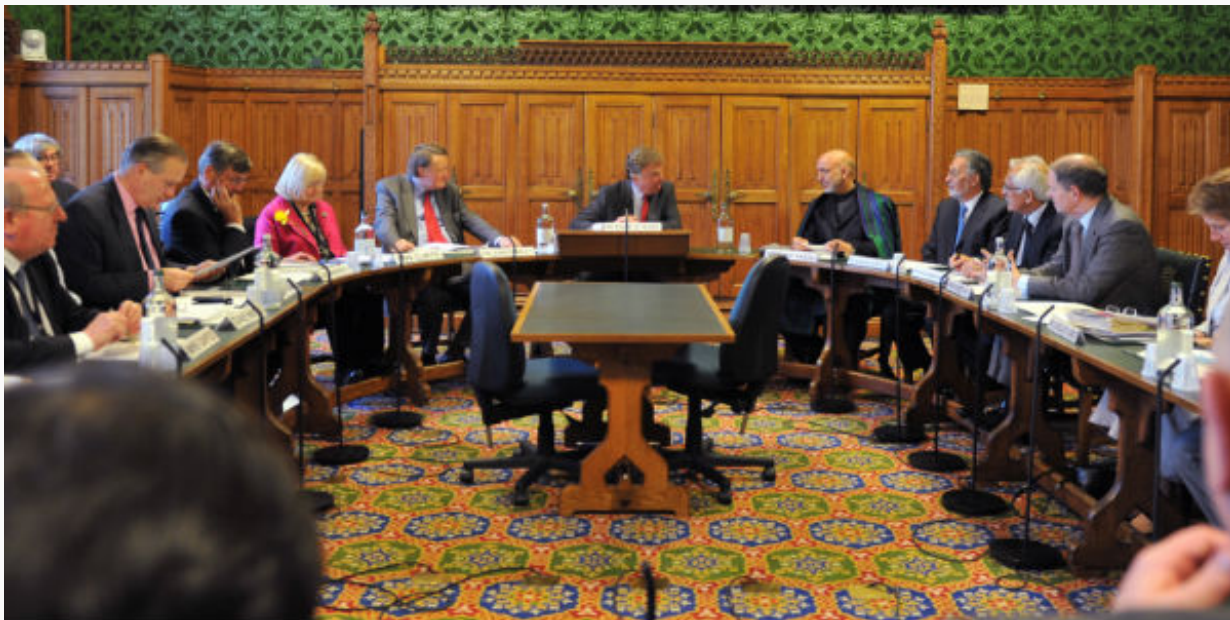
The Foreign Affairs Committee at work in 2011.