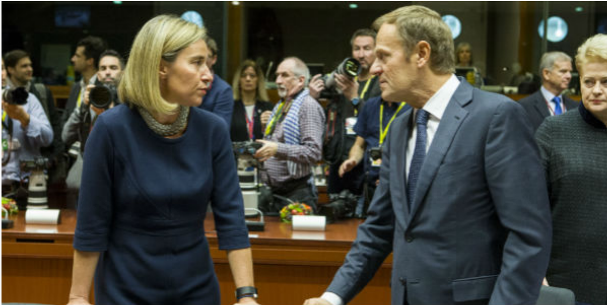
Vice-President of the European Commission Federica Mogherini and Donald Tusk, President of the European Council, talk just before a Council meeting in October 2016.

Political actors need to be nimble and respond to the opportunity to reform old policies and initiate new ones. Manuele Citi and Mogens K Justesen look at how the European Commission takes advantage of politically opportune moments (the 'gridlock interval') in the European Parliament to put forward new legislation. As a 'policy entrepreneur', it is therefore able to navigate European institutions and bring about change.